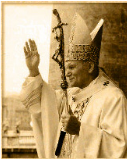
His Holiness, Pope John Paul II (Matt. 16:13-20)

When I started to get an extra spark of interest in catholic apologetics and evangelization I came into contact with not only people from the Natick area, where I live, but also the Boston and Westborough area. The common interest all these friends had is that they were loyal to the Holy Father, John Paul II, and strive to obey daily the church's teaching and yes, submit to them. At one point I thought that it was a shame that loyal Catholic's who loved the Holy Father and accepted all the church's teaching could easily pass each other at the store, in a mall or at work and not even know the great interest and common love they had. This is especially true in an age where you can hear 'catholic' religious say, "The Eucharist makes me Catholic, I don't have to obey the pope, oh no." After gathering a mailing list with address' and phone number's,